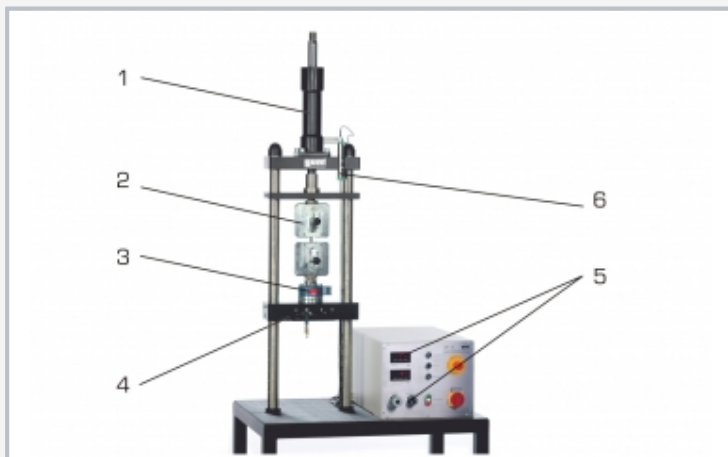
1 hydraulic cylinder for generating tensile and compressive forces, 2 operating area with the accessory WP 310.05, 3 force sensor, 4 adjustable height lower cross-member with lock, 5 displays and controls, 6 displacement sensor