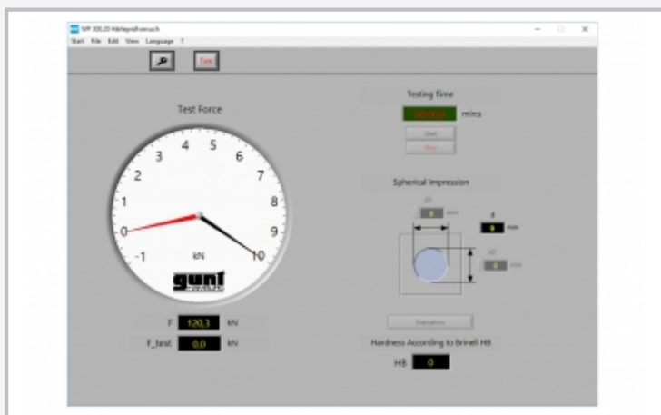
Software screenshot: Brinell hardness test