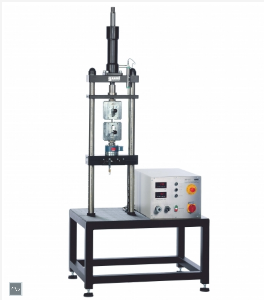
The illustration shows WP 310 together with the accessory WP 310.05.